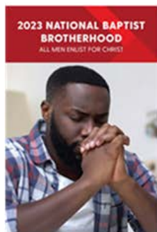
Study Book For Brotherhood