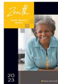
Study Book For Missionaries