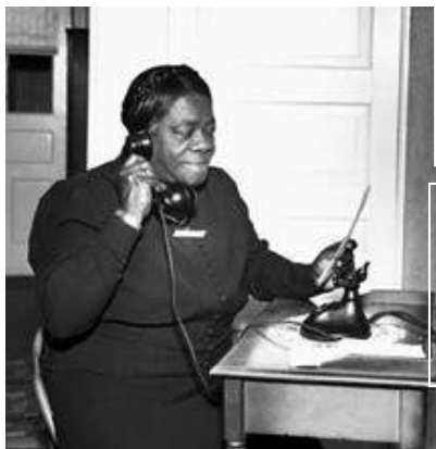
Bethune was passionate about education.

Mary McLeod Bethune was an educator and advocate for civil rights. In a time when educational options for African-American people were limited, Bethune founded the Daytona Normal and Industrial Institute in 1904, a school for black girls.