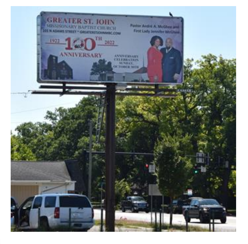
The above billboard is located at 3003 Lincolnway West East of Bendix Drive.