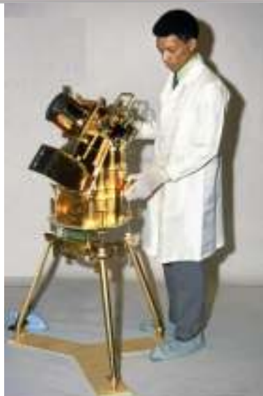
George Carruthers examine the gold-plated Lunar Surface Ultraviolet Camera prior to the Apollo 16 mission