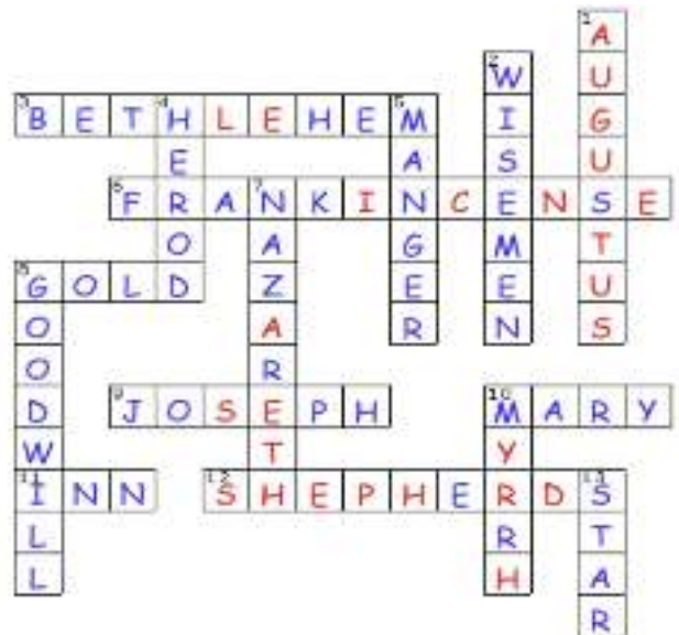
(Answers to Jesus Is Born Crossword Puzzle, page 6)